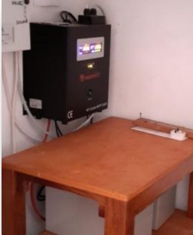
New solar system

We're mending things again, that are broken either by children, by wear or by the elements. The list is long but we have had to spend money:-